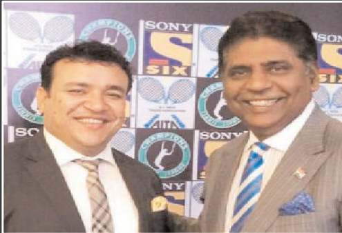
Mr. Vijay Amritraj (Tennis Legend),