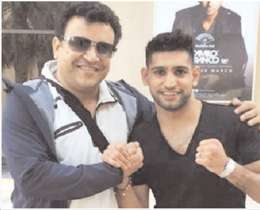
Mr. Aamir Khan (Boxing Legend),