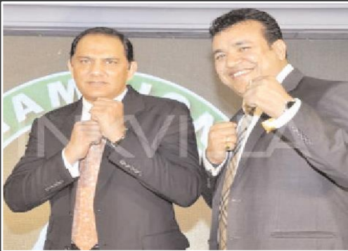
Mr. Mohammad Azharuddin (Cricket Legend).